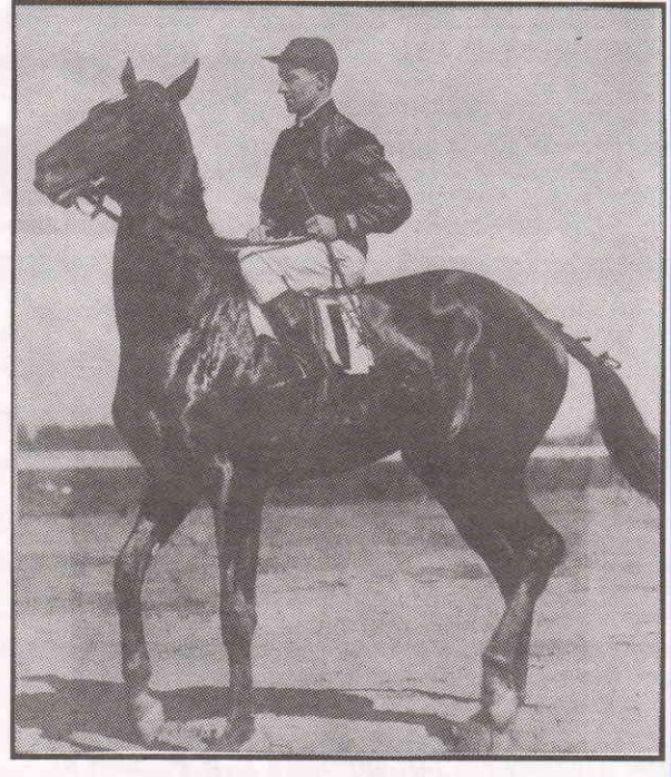
As a two year old at Belmont

What about an application where digging a trench is no problem, or where you're going into existing conduit? Innerduct can help there too. It's much nore flexible than PVC conduit, and better behaved at low temperatures. And the long lengths available go a long way to a